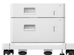
High Capacity Cassette Feeding Unit-D1*** • 2,550-sheet capacity (550-sheet upper cassette, 2,000-sheet lower cassette)